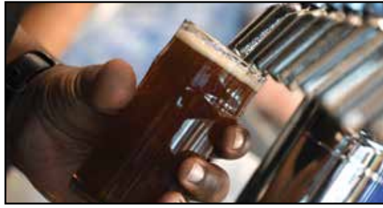
Award winning beers on tap

Kalamazoo Valley's sustainable brewing students continue to gain recognition for their superior craft beers. At the 2022 U.S. Open College Beer Championship in Oxford, Ohio, Kalamazoo Valley's sustainable brewing program was named the Grand National Champion with three gold and one silver medal out of 11 North American colleges and universities.