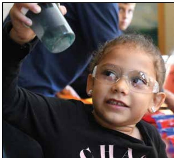
Guest with a chemistry experiment

Conduct experiments with dyes, wicking and solar printing when Chemistry Day comes to the Kalamazoo Valley Museum (KVM) from noon to 4 p.m. on Oct. 15.