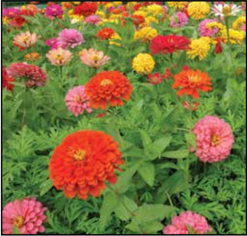
Zinnias at the Food Innovation Center

Students interested in learning how to manage landscapes and greenhouses in a way that can improve environments and reduce the impacts of climate change will soon have the opportunity thanks to a new sustainable horticulture program being launched at Kalamazoo Valley for the Winter 2023 semester.