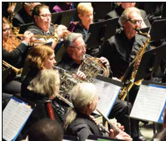
Kalamazoo Valley's campus band